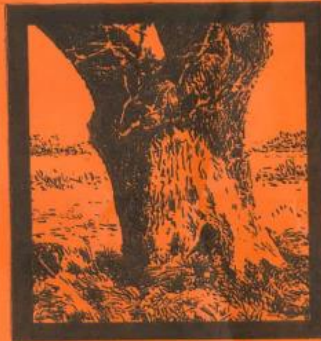
FIELD OAK AT HURN / STICKLEER LANE

WE ARE PLANNING A WALK TO VISIT THE ANCIENT OAK TREES IN, AND AROUND TACOLNESTON. WE WILL MEET AT THE WOODLANDS CLUB AT 10.30AM ON 4 DECEMBER. PLEASE COME AND JOIN US.