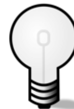
...a light bulb...