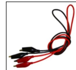
...electrical wires and crocodile clips.

Some materials do not allow electricity to pass through them. These materials are known as electrical insulators.